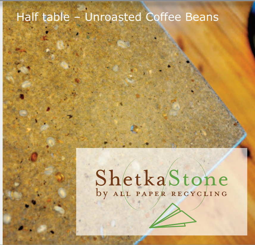
Half table – Unroasted Coffee Beans

Recently, they commissioned ShetkaStone to create a community table for this location. Using materials common to Caribou Coffee™ houses, ShetkaStone/APR used Caribou's coffee beans (whole and ground), burlap coffee bags and reclaimed cardboard to create a dynamic, visually engaging tabletop finished with UV-cured polyurethane for additional durability.