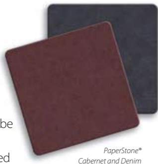
PaperStone® Cabernet and Denim