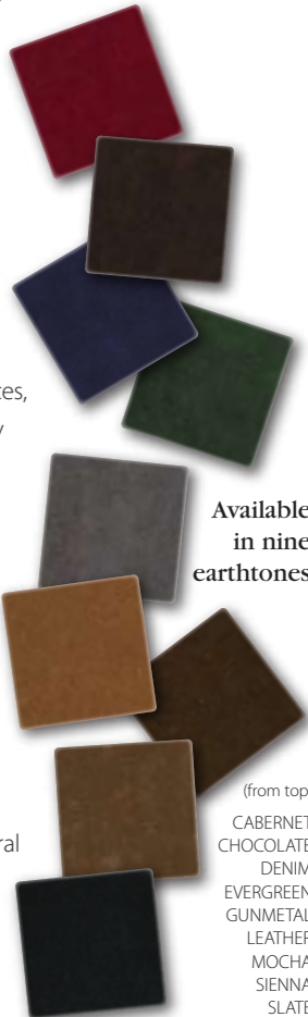
Available in nine earthtones

As a natural product, PaperStone® may reflect variations inherent in the natural source materials used to manufacture it. As a result, actual product appearance may vary slightly from samples and lot to lot.